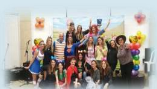
During the Corona, the women in Tangent Israel have worked and assisted the needy and elderly families who are quarantined in homes.